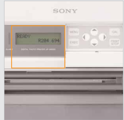
Real-time monitoring via the integrated LCD panel