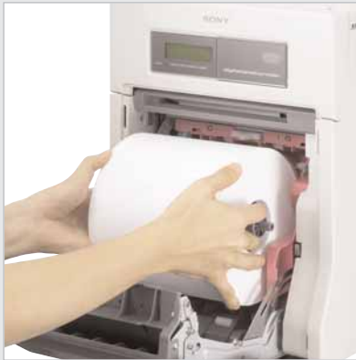
Front-loading operation makes it fast and simple to load the paper roll