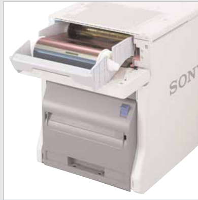
Easy slot-in ink ribbon replacement